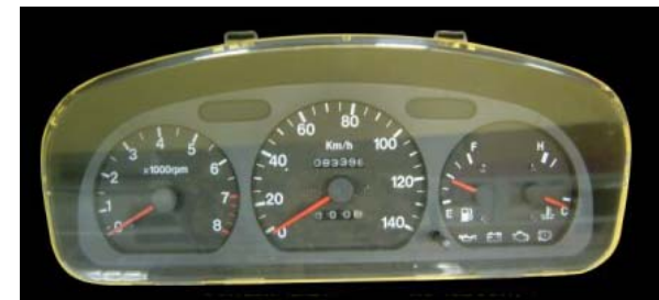
gauge instrument we need for art design

We now have BG, RW, RS, RRW-A, RRW-B, RS and wish to design it yourself, please send the art design or description to us your idea. G and FLAME 7 design. If you do not like any of them